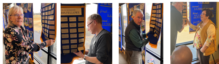
Congratulations for these Paul Harris Awardees